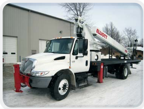
H70F on IH 4300