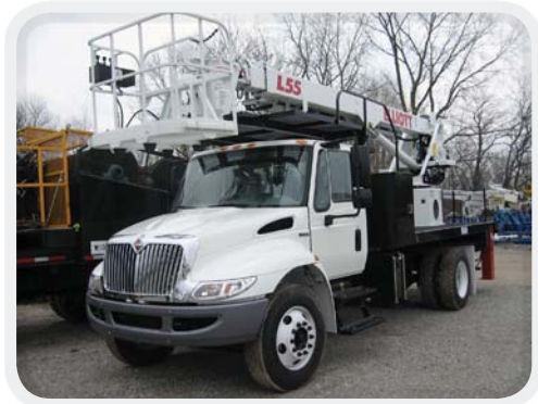
L55R on IH 4300

Steel rectangular tube sections with 1/4 " wall thickness. Assembly includes heavy-duty cylinder fittings, pivot pins, and replaceable wear pads. One 2-1/2 " "piggyback" internal cylinder extends the outer boom sections.