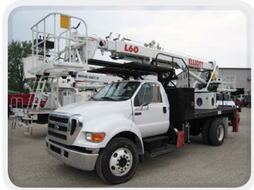
L60R on Ford F750