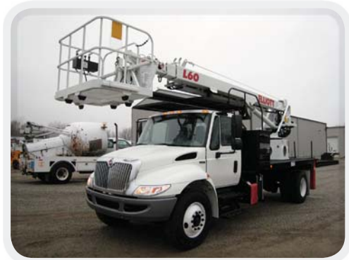
L60R on IH 4300

High strength steel rectangular tube sections with 1/4" wall thickness. Assembly includes heavy-duty cylinder fittings, pivot pins, and replaceable wear pads. Two opposed 2-1/2" "piggyback" internal cylinders with 1-1/2" rods extend the two outer boom sections.