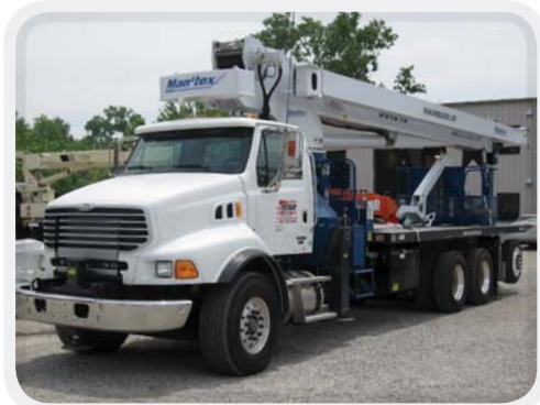
35124C on Sterling LT9500