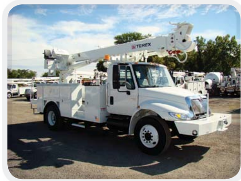
4047 on Utility Body IH