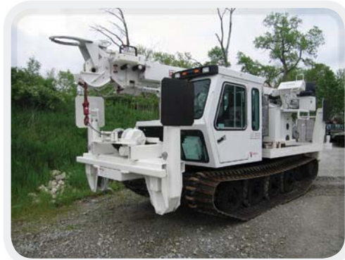
4047 on Camoplast GT2000HY