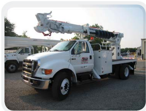
4047 on Flatbed Ford