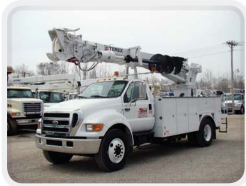
5052 on Utility Body Ford