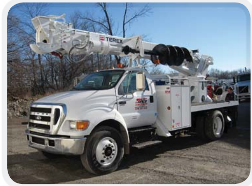
5052 on Flatbed Ford