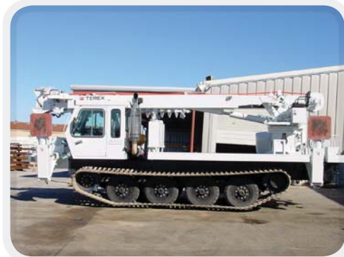
6060 on Camoplast GT3000HY