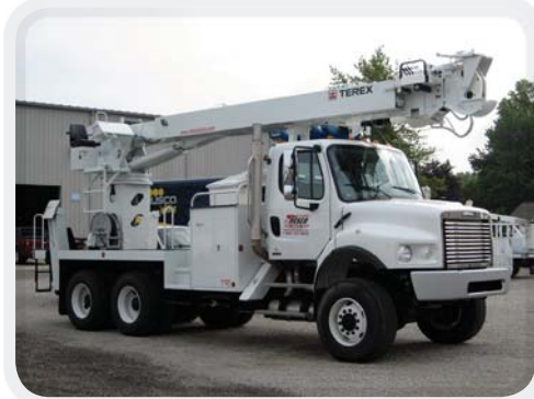
6060 on FL M2106V 6X6