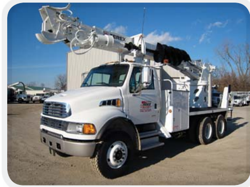
6060 on Sterling Acterra