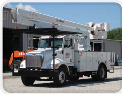
FC55 on Peterbilt 335