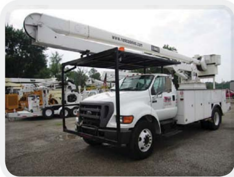
5FC55 on Ford F750