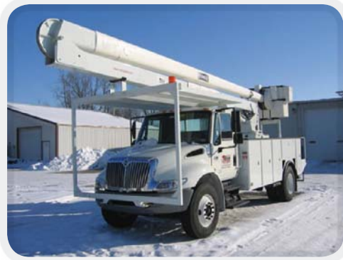
5FC55 on IH 4300