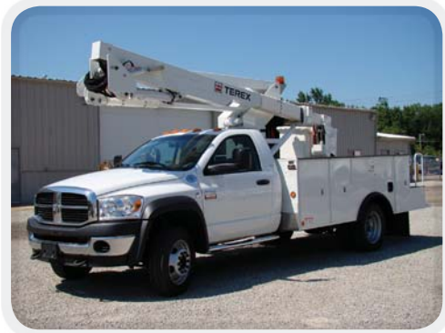
LT40P on Dodge