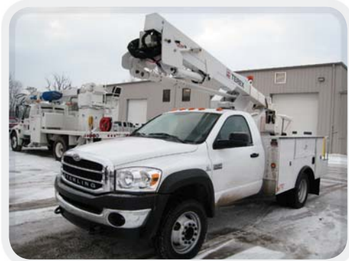
LT40P on Sterling Bullet