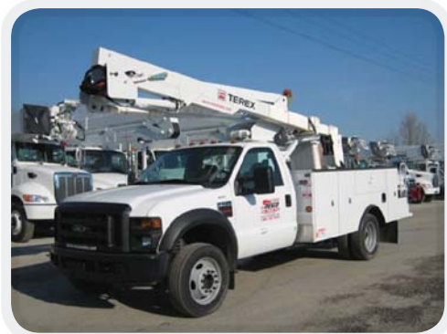
LT40P on Ford 4x4