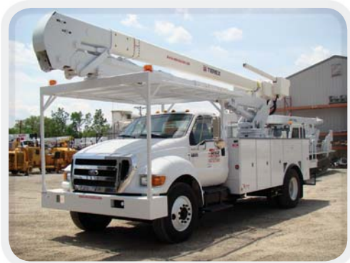
5TC55-MH on Ford F750