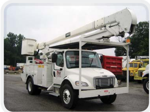
5TC55-MH on Freightliner FL70