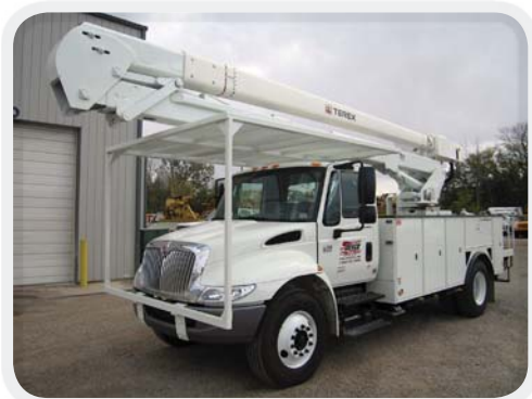
5TC55 on IH 4300