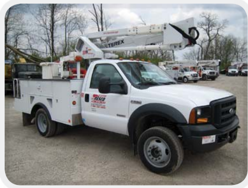
TL38P on Ford 4x4