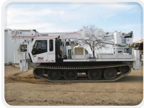
General on Camoplast GT3000HY