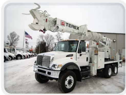
General on IH 7400 6x6